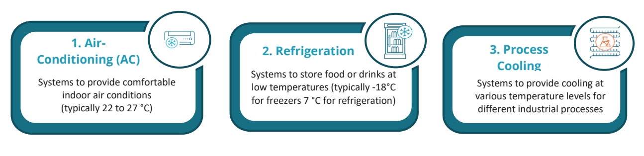
Figure 1 Different subsegments of cooling

Cooling generally refers to the transfer of heat from a substance of higher temperature to a substance of lower temperature. Three segments are distinguished in the following: Air conditioning, refrigeration, and process cooling as shown in Figure 1 .